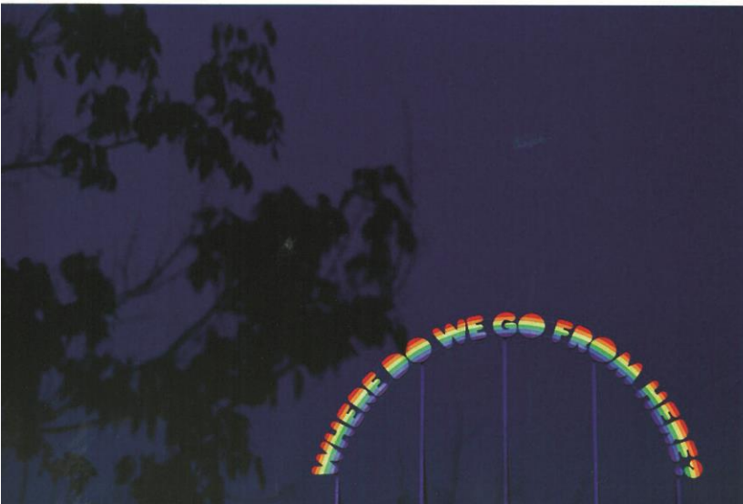
Left: Ugo Rondinone, Where Do We Go from Here? , 1999/2017, neon, Perspex, translucent film, aluminum. From the series "Rainbow Poems," 1987–2017. Installation view, Mustafa Kemal Cultural Centre, Istanbul. Below: Pedro Gómez-Egaña, Domain of Things , 2017, metal, wooden panels, furniture, sound, performance. Installation view, Galata Greek Primary School, Istanbul.

One might have expected questions about the concept of neighbors to lead not so much to discourse as to discordant noise, given, for example, the everyday cacophony