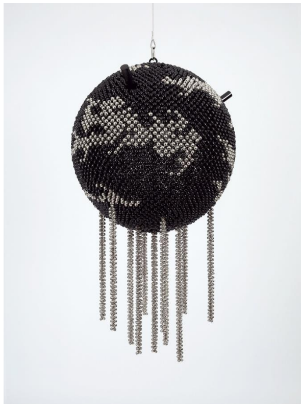
Haegue Yang, Sonic Gym Map , 2019, powder-coated stainless steel frame, powder-coated mesh, powder-coated handles, steel wire rope, black brass and nickel plated bells, metal rings, 122 × 70 × 70 cm.

The watercolour hangs in the hallway, introducing Yang's show. Mounted on chicken wire, its characters appear menacing, surrounded by flying elements – flags, planes, bombs. Entering the main exhibition space prompts similar feelings of fear and bewilderment. Fractals of geometric objects span different dimensions: the floor, the ceiling, a mural. Strings of bells dangle from spheres like weapons of torture over bouncy balls on crosses of tape. Revolving projectors protrude from the walls like CCTV cameras, casting shadows through venetian blinds onto the mural. A man in scrubs operates an ergonomic surveillance vehicle beneath cascades of airbrushed greenery, while dry ice spills in through the back door beneath a drone. The effect is alluring: is this a Silicon Valley data scientist's dream of deliverance? A plasmic prospectus for an iHospital?