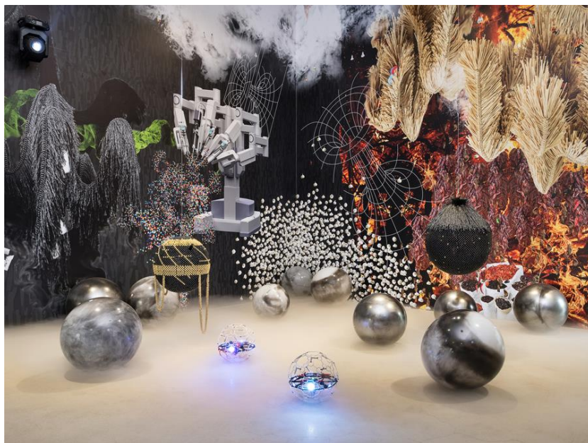
Haegue Yang, 'When The Year 2000 Comes', 2019, installation view.

The strips of tape that cover the gallery floor form a grid, bisected by diagonals, which appears to emanate from the sculptures. Modelled after the board used in Janggi (Korean chess), the pattern swerves into areas of irregularity as it follows the path of Yang's 'pieces' – hovering, rolling, creeping up the walls. Her Sol LeWitt Vehicles (2018) boast a similar rebellious streak. Aluminium cube frames affixed with blinds, wheels and handles turn the legendary minimalist's 'Variations of Incomplete Open Cubes' (1974) into mobile, interactive devices. If LeWitt went by the principle expressed in his 1967 essay 'Paragraphs on Conceptual Art' that 'the idea becomes the machine becomes the art', Yang seems to be taking his machine and making it glitch.