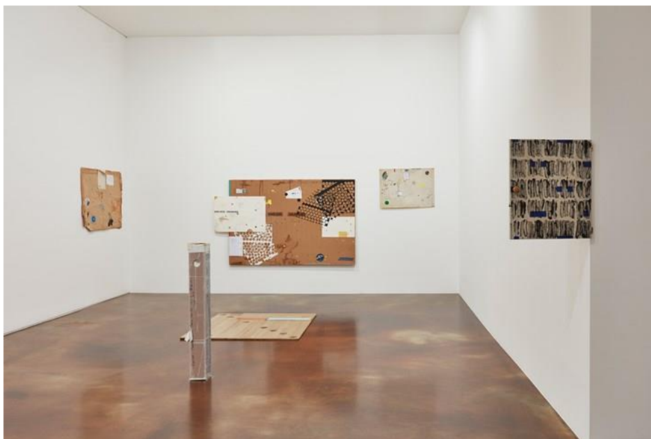
Installation view: Endless Drawing , Kukje Gallery K2, Seoul (20 March–22 April 2018).

At 71, Kim is affable, good-humoured, and generous in conversation. I spoke with the artist at Art Basel in Hong Kong (29–21 March 2018), where Kukje Gallery presented a solo booth of the artist's work as part of the fair's Kabinett sector.