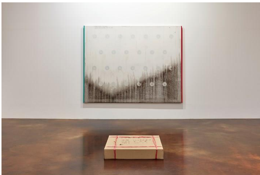
Kim Yong-Ik, Eco Anarchism Project 1 (2017–2018). Mixed media on canvas. 181 x 232.5 cm; Untitled (Dedicated to 1981 'Today's Circumstance') (2010). Second version, after lost original of 1981. Ink, packing strap, box. 15 x 81 x 80 cm. Installation view: Endless Drawing , Kukje Gallery K2, Seoul (20 March–22 April 2018).

It arises from the fine line between art and everyday reality. I'm constantly thinking: 'I'm an artist, do I want to be an artist, this is an artwork but this doesn't want to be an artwork.' How do I rectify that? The term is a combination of different philosophical ideas and is not a word that I've created myself, but I adopted the term to explain my idea of how an artwork should embrace damage and be open to change. The artist should be allowed to destroy the work if he wants to embrace dirt and time. I'm very keen on humble objects and I wish to have my works open.