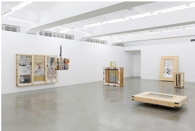
Installation view: Closer... Come Closer..., Imin Museum of Art, Seoul (1 September–6 November 2016).

I titled those paintings from the 1990s 'Closer, Come Closer'. From a distance, they look like modernist paintings. But if you come closer, you can see little marks, cracks and even where I sometimes stick my hair on the surface.