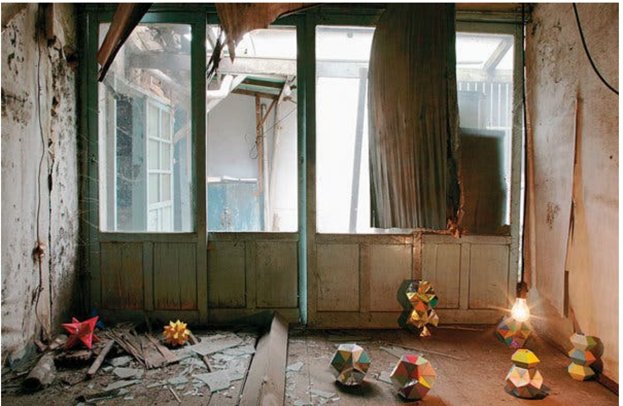
Yang's 2006 installation "Sadong 30," in an abandoned home in Incheon, South Korea. Credit...Haegue Yang, "Sadong 30," 2006, installation view, light bulbs, strobes, light chains, mirror, origami objects, drying rack, fabric, fan, viewing terrace, cooler, mineral-water bottles, chrysanthemums, garden Balsams, wooden bench, wall clock, fluorescent paint, woodpiles, spray paint, IV stand in an abandoned home in Incheon, South Korea, photo by Daenam Kim, image courtesy of the artist and Greene Naftali, New York

That same year, at the São Paulo Biennial, Yang considered her perpetual displacement in "Series of Vulnerable Arrangements — Blind Room." Black venetian blinds hung from the ceiling surrounding a video trilogy in which Yang muses on being both geographically and existentially lost. A humidifier, an infrared heater, scent emitters and an air-conditioner suffused the space with shifting notes of sensuality, discomfort and nostalgia. The blinds, permeable barriers between the public and private realms, remain one of Yang's signature materials. In her work, they are metaphors for obscurity and exposure, symbols of contact between people and of willful isolation.