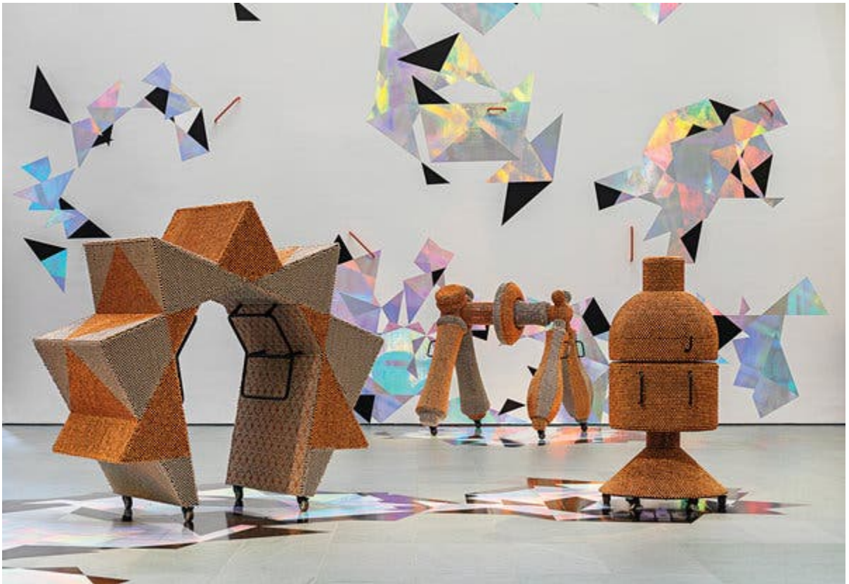
Yang's 2019 installation in the atrium of the Museum of Modern Art in New York, which includes mobile sculptures and subtle references to geopolitical events. Credit...Haegue Yang, "Handles," 2019, installation view of 6 Sonic Sculptures, sound, wall and floor element, commissioned for The Marron Atrium by The Museum of Modern Art, New York, photo by Dawn Blackman, image courtesy of the artist, Greene Naftali, New York and MoMA

The artist herself is like the calm center of a high-velocity hurricane. In 2019 alone, she was in 15 shows on four continents. Remarks on how busy she must be tend to be greeted with the sort of wary skepticism with which one might regard a doctor's suggestion to lay off the exercise and have a cigarette. Yang acknowledges that she might be "doing a lot," but on the other hand, she suggests, notions of "rest" and "free time" are "sometimes too neoliberal to protect blindly. When passion and devotion goes over the border, is it something to condemn?" She is always working, and has spent her career deliberately isolating herself from friends and family as a kind of artistic method. The only downside is existential: "What comes along with the intensity of the work is you almost lose yourself," she said, although even this condition has its advantages: "I think the confusion is good to have."