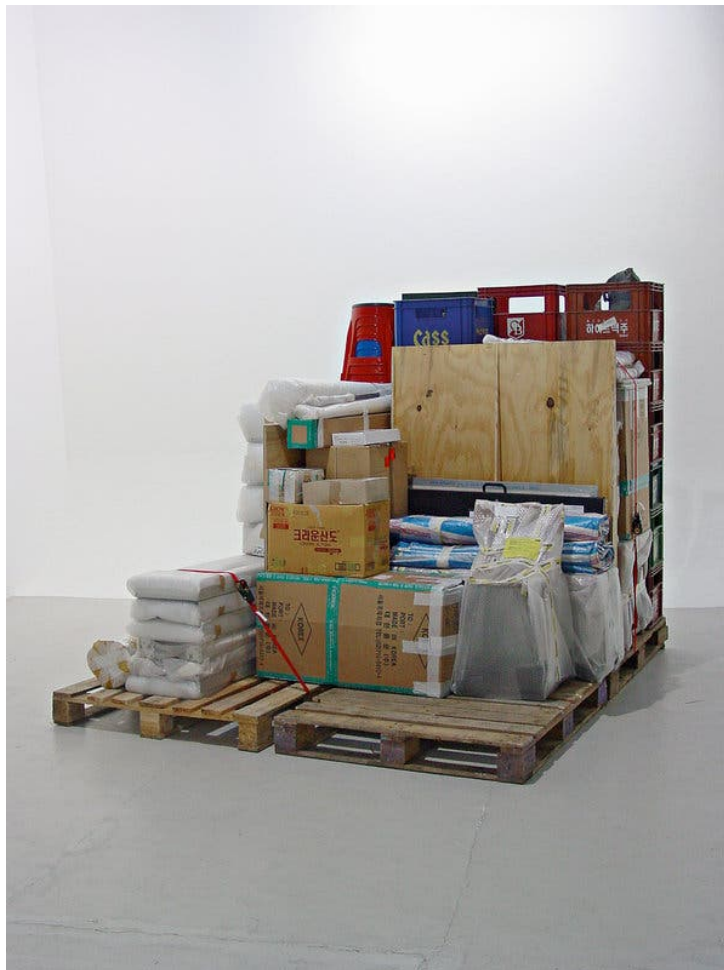
Yang's 2004 "Storage Piece," a sculptural installation of some of her older artworks that have been wrapped and stacked. Credit...Haegue Yang, "Storage Piece," 2004, installation view, wrapped and stacked art works, Euro pallets, dimensions variable, Haubrok Collection, Berlin, photo by Lawrence O'Hana Gallery, image courtesy of the artist and Greene Naftali, New York

The piece, "Anthology of Hague Archives," might be read as ironic: a humorously self-important gesture from an obscure young artist whose career was a long way off from institutional support. But, as Yang has noted, it also might have been "an act of self-empowerment by an immigrant artist" at a moment when gaining international art-world recognition as an Asian woman was practically unheard-of. "It just didn't exist," she said. Role models were scarce. The Thai artist Rirkrit Tiravanija, who is known for performances in which he cooks and serves meals for large audiences, "was the only one who wasn't painted by Orientalism," she said, meaning that he was seen as an artist first, an Asian artist second.