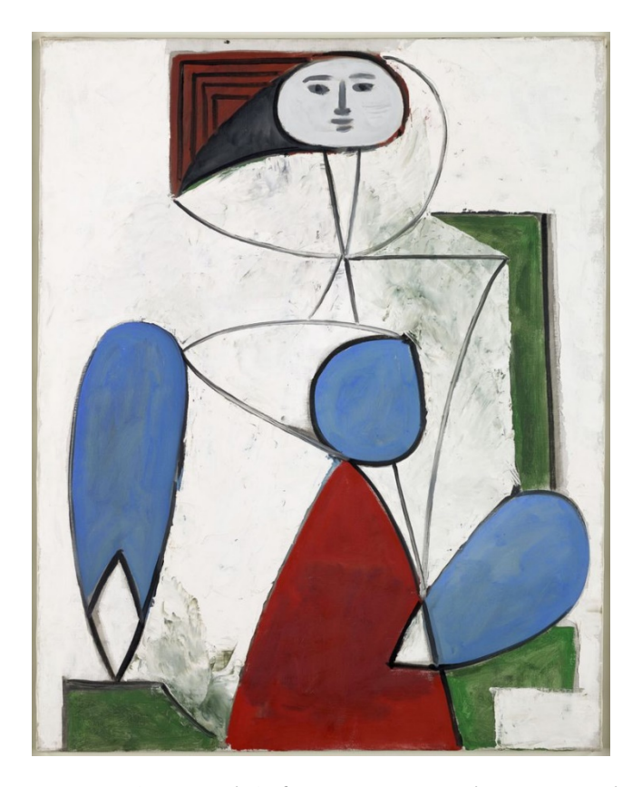
Pablo Picasso's "Woman in an Armchair" from 1947 seems to share common elements with Alexander Calder's painted shapes. It will be part of the Calder-Picasso exhibit at the High Museum of Art.

"Calder and Picasso are among the most consequential artists of the 20th century," said the High's director Rand Suffolk, in a statement. "Their work remains undeniably compelling, and although we've presented it separately on many occasions, this exhibition offers the chance to see it from a particularly unique perspective."