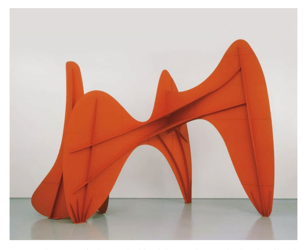
A 1-to-5 scale maquette of a sheet-metal stabile called "La Grande Vitesse" by Alexander Calder will be part of a special exhibit coming to the High Museum this summer pairing the works of Calder and Pablo Picasso.

The High's curator of European art, Claudia Einecke, said that seen side by side, the affinities between these works become apparent. She added, in a statement, "In fact, we might think of the exhibition as a kind of non-verbal version of the artistic conversation that Calder and Picasso, by all accounts, did not have in person."