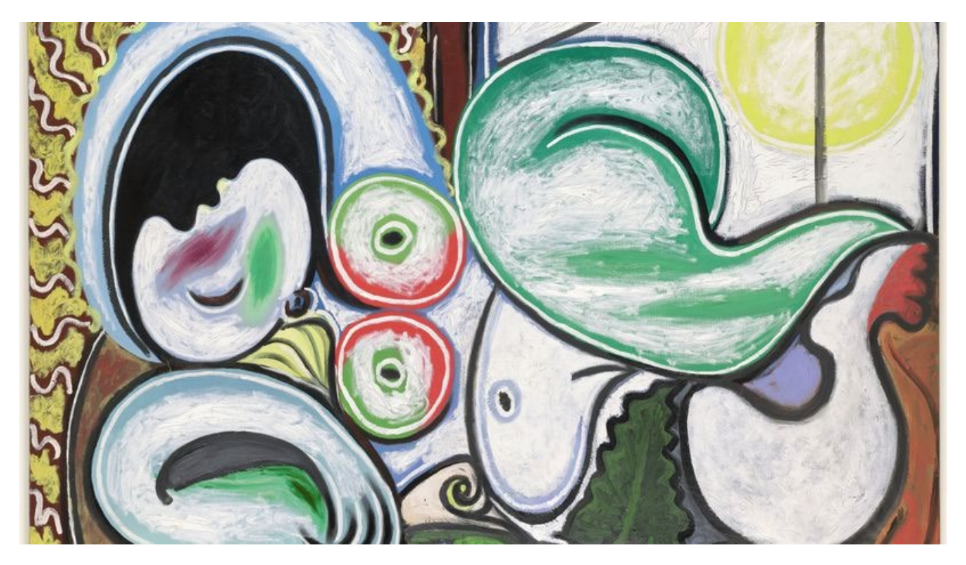
"Reclining Nude," by Pablo Picasso from 1932, is part of the Calder-Picasso exhibit coming to the High Museum June 26. More than 100 drawings paintings and sculptures by Picasso and Alexander Calder will be on display through the summer.

Alexander Calder and Pablo Picasso met on only a few occasions, but their works of art often communicated.