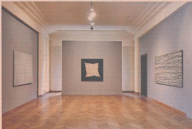
▲ Exhibition view of "When Process Becomes Form: Dansaekhwa and Korean Abstraction" at Villa Empain of The Boghossian Foundation

The celebrated exhibition of Dansaekhwa paintings, previously shown at the Venice Biennale last year before arriving in Brussels, is one of the largest showcases of Dansaekhwa paintings outside of Korea, featuring some 50 paintings by seven leading Dansaekhwa art-