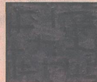
▲ "Conjunction 98-144" by Ha Chong-hyun, showcased at Art Brussels 2016

"Dansaekhwa and Minimalism" presents the most representative artists of each movement to highlight the subtle diversity of aesthetics and ideas explored by the two move-