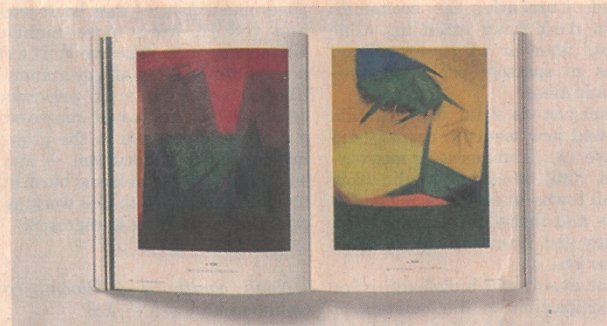
"Yoo Youngkuk: Quintessence" Kukje Gallery