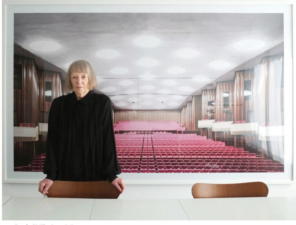
Above, Candida Höfer, at her Cologne home, in front of Stadthalle Mülheim I 2009

decorated halls, standing on balconies lost in thought or perhaps admiring the striking visuality of organised lite rature. 'Libraries are the embodiment of visual order in a given space,' Höfer points out. 'At the same time, libraries offer a variety in colour and light and thoughts of possibilities to learn and to know' Plus, she adds, 'I like books'. No matter the subject, Höfer's images transport viewers into the space at hand, with the apparent emptiness opening up the possibility for individual meditations and projections.