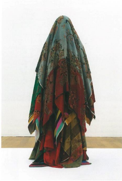
Kimsooja, Encounter - Looking into Sewing, 2012.

The Korean-born artist's approach to videomaking is akin to that of a weaver: threading and looping disparate cultures and narratives together, creating something far greater than the sum of its parts. In the fourth chapter of her ongoing work Thread Routes (2010-), premiered in this solo exhibition, subject reflects method as she traces textile traditions through a variety of global cultures.