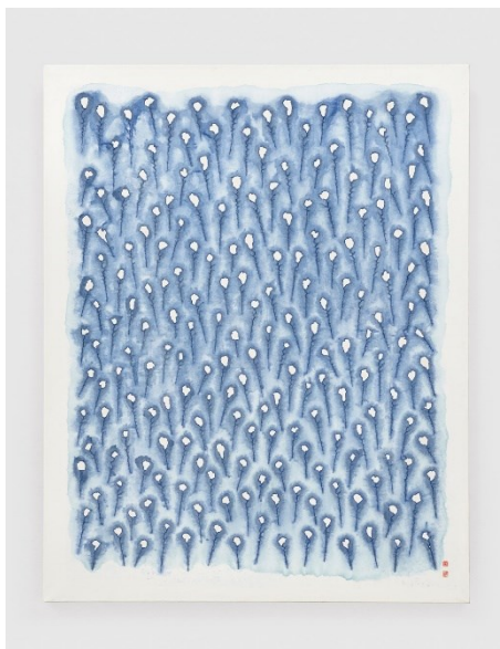
Kwon Young-woo, Untitled , 1986,

© Estate of Kwon Young-woo, courtesy of the estate and Blum & Poe, Los Angeles/New York/Tokyo