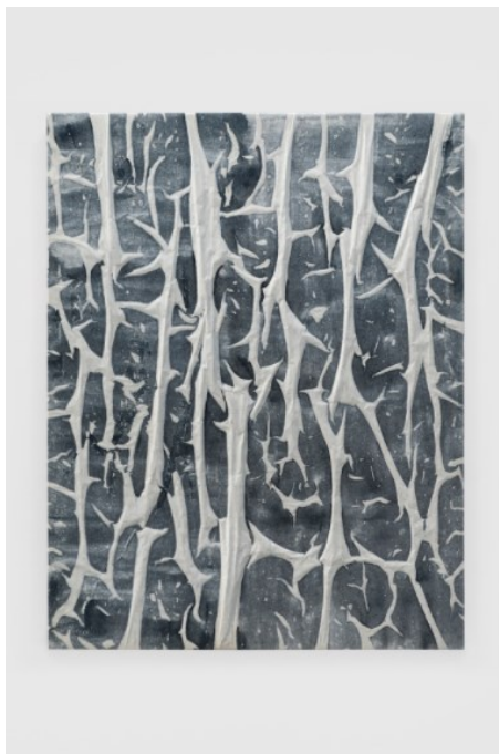
Kwon Young-woo, Untitled , 1992,

© Estate of Kwon Young-woo, courtesy of the estate and Blum & Poe, Los Angeles/New York/Tokyo