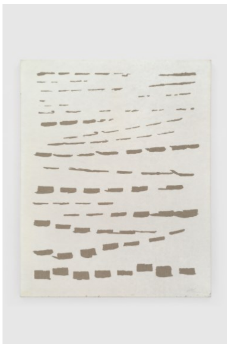
Kwon Young-woo, Untitled , 2002,

© Estate of Kwon Young-woo, courtesy of the estate and Blum & Poe, Los Angeles/New York/Tokyo