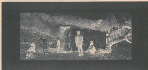
▶ A scene from Park Chan-kyong's 55-minute video work "Belated Bosal" (2019)

eo work comprising a set of photographs that show empty landscapes after the catastrophe, juxtaposed with images showing the radioactive contamination of organisms living there.