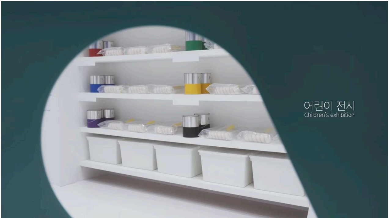
어린이 전시 Children's exhibition