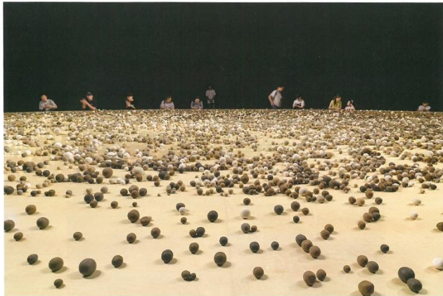
above: Archive of Mind , 2006 (installation view, MMCA, Seoul).