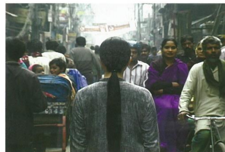
A Neelie Woman (stills), 1999-2001, eight-channel video, 6 min 33 sec, loop.