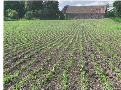
Joining page: Sowing into Painting , 2020, two planted varieties of flaxseed at Wana's Konst, Sweden.

(Shanghai, Tokyo, Mexico City and Delhi). It's a work that explores the ways in which losing yourself is linked to finding yourself, about the individual and the collective, and one that has added resonance now that crowds are a source of added fear. The last is something the Nobel Prize-winning writer Elias Canetti described as 'the touch of the unknown' in his 1960 analysis of relations between the self and others, Crowds and Power . Although one of Canetti's assertions – 'It is only in a crowd that a man can become free of this fear of being touched. That is the only situation in which fear turns into its opposite' – is looking a bit shaky right now.