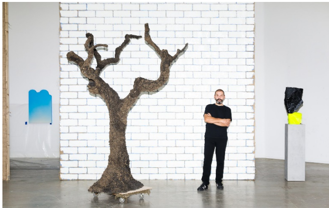
Ugo Rondinone in his Harlem studio.

The Swiss-born, New York-based artist invites us into his Harlem space as he prepares for an opening with Miami's Bass Museum of Art.