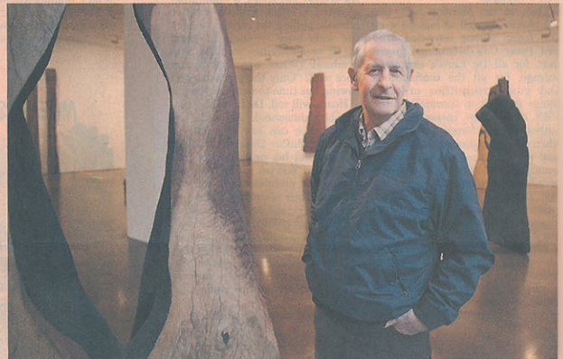
Artist David Nash