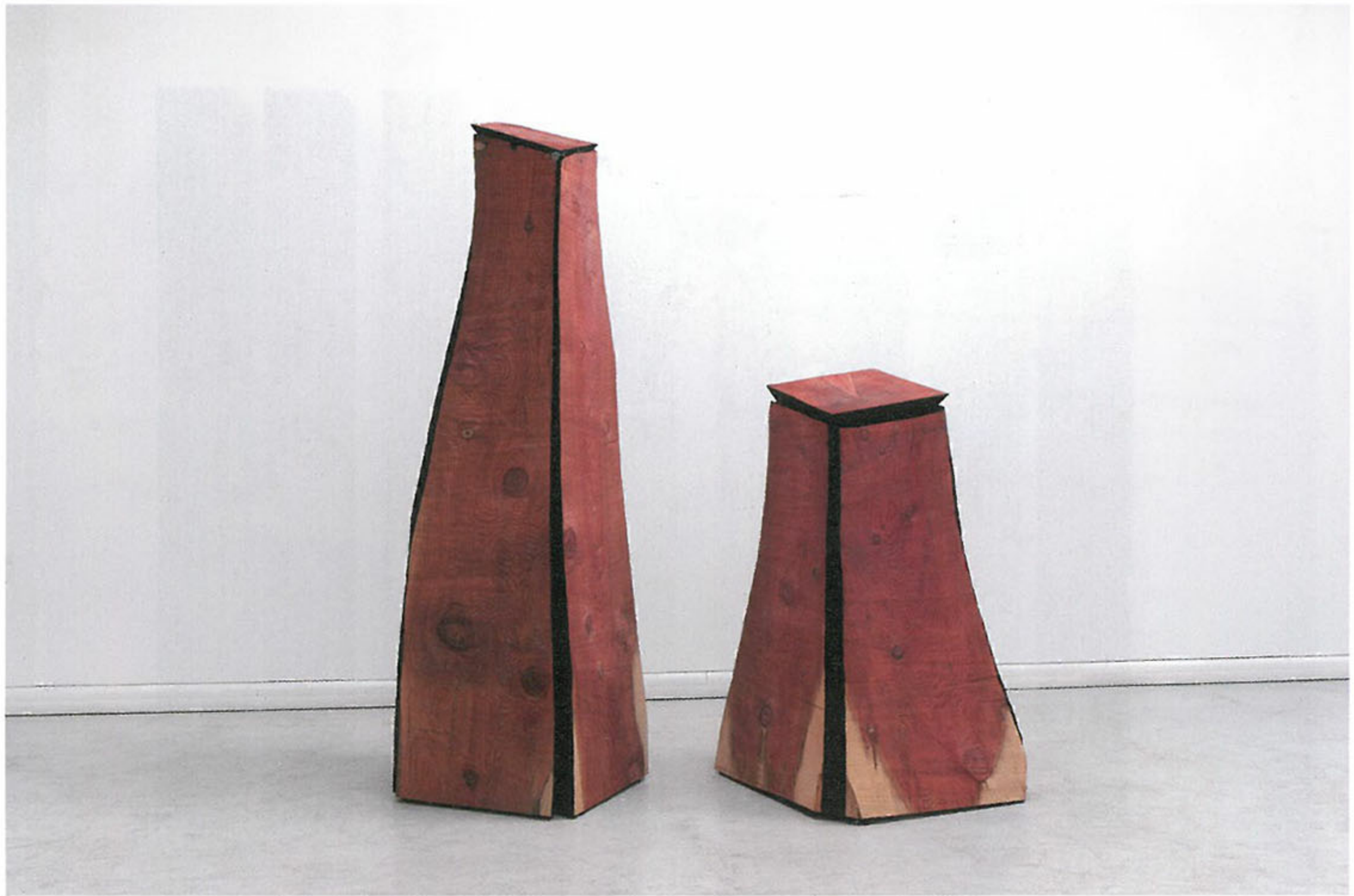
Two Cut Corner Columns, 2011, redwood 2 parts: 1) 240×69×76cm 2) 153×88×86cm

David Nash is widely celebrated for his ethical approach to nature and the exquisitely beautiful objects he shapes from wood found in the wild. To fully appreciate the rough-hewn and lyrical sculptures wrought by Nash, it is essential to understand how the artist views trees and the role of ecology in his practice. Since the beginning of his prolific career, Nash has been committed to making artworks in concert with his chosen material, using only trees that have fallen naturally due to weather or disease.