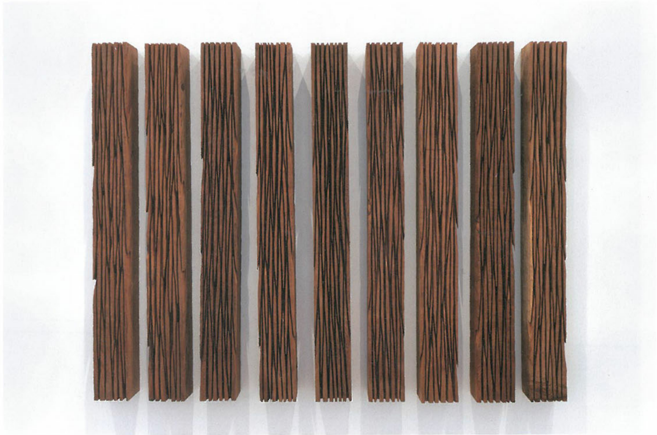
Red Wall, 2011, redwood 198x262x21cm(9 parts) © David Nash

These rapidly led to a series of solo exhibitions throughout the UK and his international reputation was established after his first solo shows overseas were held in 1980 at Elise Meyer Gallery, New York, and at Galleria Cavallino, Venice, Italy.