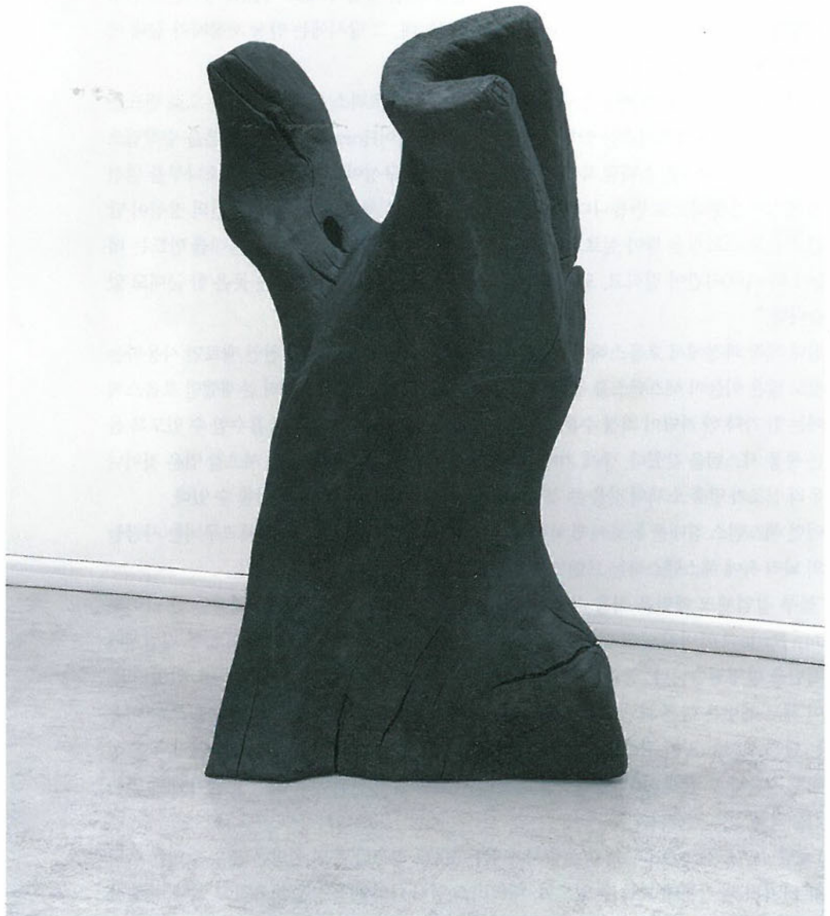
Torso, 2011, bronze, patinated black 196×94×61cm

Kukje Gallery is pleased to announce the opening of David Nash, a major exhibition of both sculpture and works on paper by one of the 21st centuries most respected and beloved sculptors. Throughout this stunning exhibition the artist's life-long commitment to nature and the power of raw materials is evident.