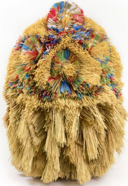
studio haegue yang – hairy taoist fairy egg [2015] – courtesy galerie chantal crousel

a new season, a whole new wardrobe. well, that's what galleries lafayette is instigating. but leave it to the iconic parisian department store to instill the message by way of evocative communication. to present the new a/w 2016 collections it has collaborated with korean artist haegue yang [1971] under the moniker quasi-pagan modern. yang's creative output is based on the intricate mirroring of civilizational references relating to social and political history and phenomena, as well as on reinterpreting archetypal forms from the avant-gardists, to produce a multifaceted contemporary expression. and as a result, her work comprises of striking juxtapositions and contrasts. the collab with galleries lafayette not only features a series of windows installations at its flagship on bustling boulevard haussmann in paris, but also at its 51 other stores across france.