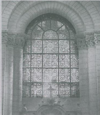
Left, one of about 200 liturgical objects and vestments on display. Right, a stained-glass window at the cathedral.

chitect of Sacré Coeur de Montmartre in Paris. For the project, which has taken eight years from design to completion, Mr. Othoniel sought to stay within the Romanesque stylistic tradition, translated into his own idiom of colorful glass beadwork.