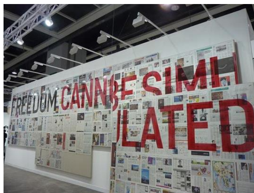
Rirkrit Tiravanija, Untitled 2016 (freedom cannot be simulated, south china morning post, september 26-27-28-29-30, 2014), 2016 Oil and newspaper on linen overall dimensions variable Exhibitor: Gallerie neugerriemschneider