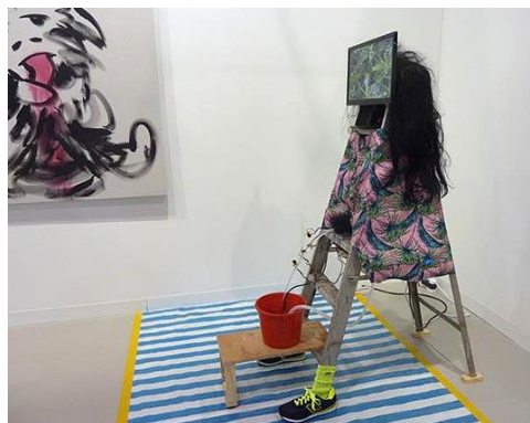
Joel Kyack The Tourist, 2016 Aluminium ladder, CCTV equipment, micro cameras, LED monitor, wig, bucket, wood pump, hose, water, sneakers, socks, fabric, wire, hardware, sandbags Exhibitor: Workplace Gallery, London