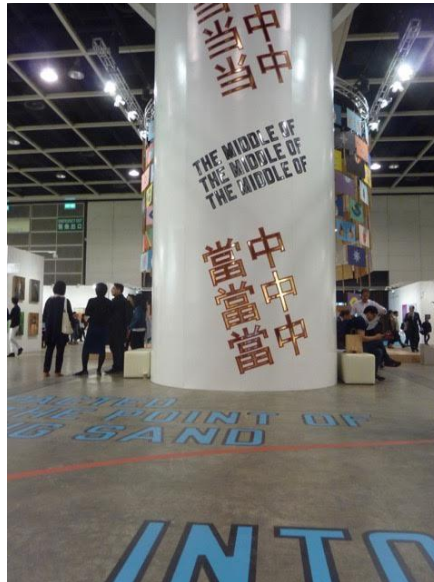
Lawrence Weiner, The Middle of, The Middle of, 2012 Dimensions variable Exhibitor: Marion Goodman Gallery