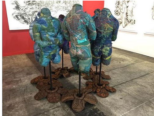
Jimmy Ong, Seamstresses' Raffleses #1-7, 2016 Cotton and Dacron Stuffing Dimensions variable Exhibitor: Fost Gallery, Singapore