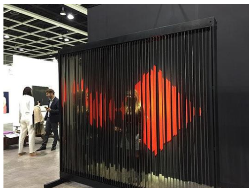
Julio Le Parc, Cloison a lames reflechissantes, 1966/2005 Wood, paint, stainless steel ed. 3/9 230 X 264 X 80 cm - 120 X 120 Exhibitor: Gallery Nara Roesler