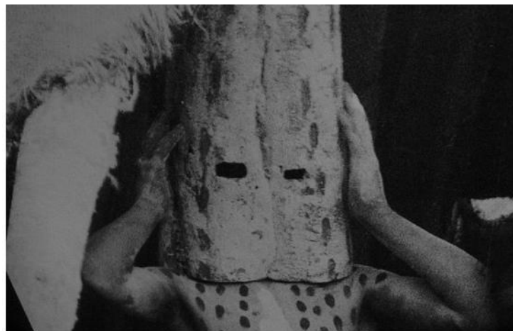
Lina Selander, Silphium, film still, 2014