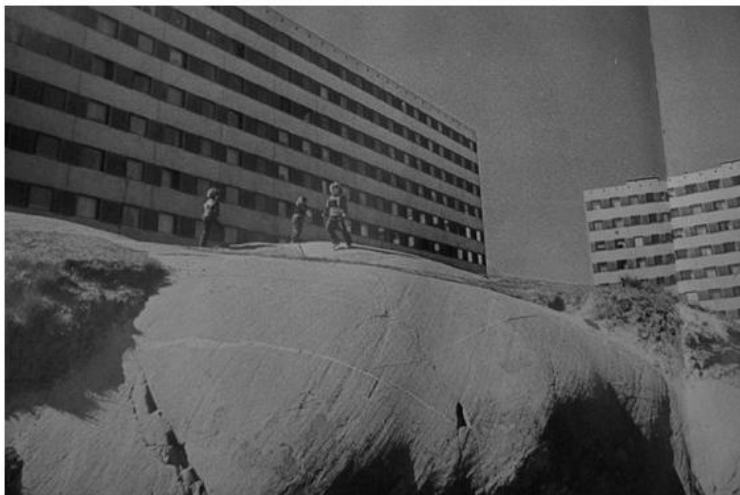
Lina Selander, Silphium, film still, 2014