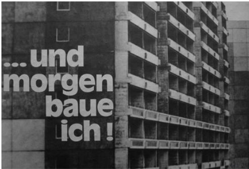
Lina Selander, Silphium , film still, 2014

The Institute of International Visual Arts (Iniva) , London, is currently hosting two concurrent exhibitions that share an interest in manipulating the documentary form to explore themes of religion, history, aspirational society and the role of film in the modern world. The work of filmmakers Park Chan-kyong (South Korea) and Lina Selander (Sweden) is now showing at the London institution as part of an EU-funded research project into internationalism and the legacy of colonialism.