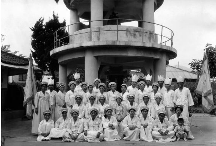
Park Chan-kyong, Photo documentation of a religious group in Sindoan, 1960s