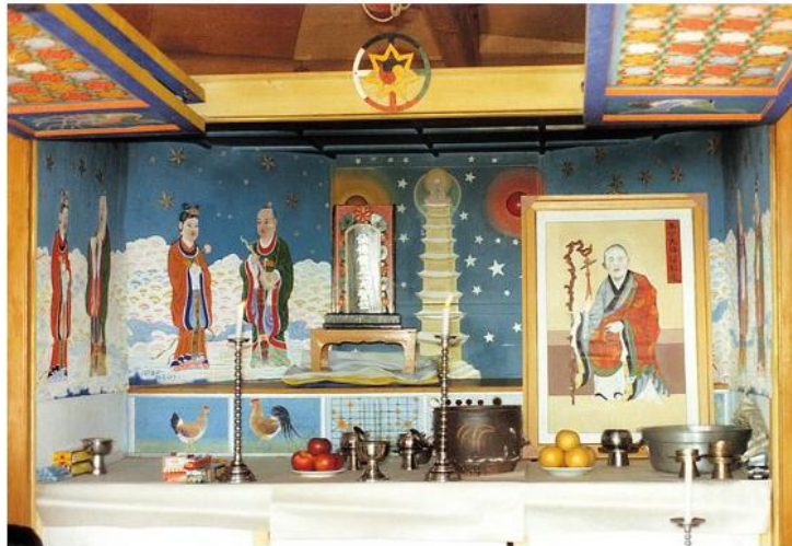
Park Chan-kyong, A shrine at Sindzan, 1970s