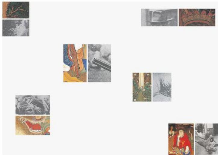
Park Chan-kyong, Tigers, photomontage, 2007