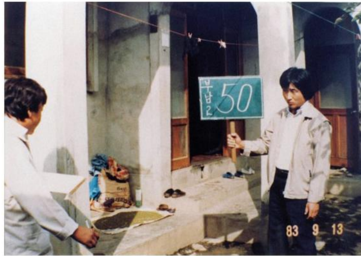
Park Chan-kyong, Photo documentation of development plan in Sindoan, 1980s