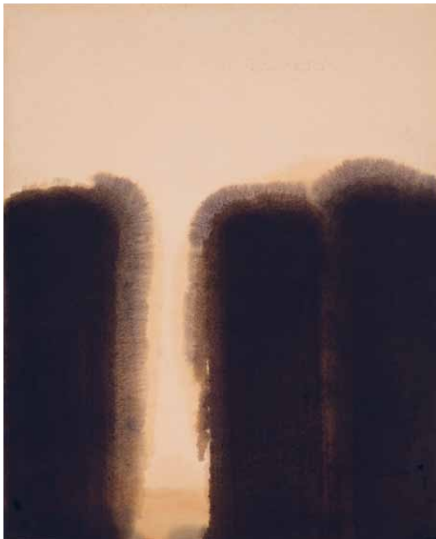
1 Yun Hyongkeun Burnt Umber & Ultramarine Blue , 1978, oil on linen, 1.6 × 1.3 m

We need only think of the extent to which artists like Kwon Young-woo or Yun Hyongkeun challenged received notions about particular media. As artists who had been educated in the 1940s and '50s, just after Korea's liberation from Japan in 1945, they contended with the legacy of a Japanese imperial bureaucracy that very clearly distinguished between media based on their constituent materials – oil painting vs. ink, sculpture vs. printing etc. This taxonomy was not easily ignored. Even well into the 1970s, painting – specifically, oil painting – took pride of place; sculpture still hadn't shaken its pejorative associations with menial labour. At the same time, by the early '70s the old arbiters of value such as the Kukjŏn – the annual government